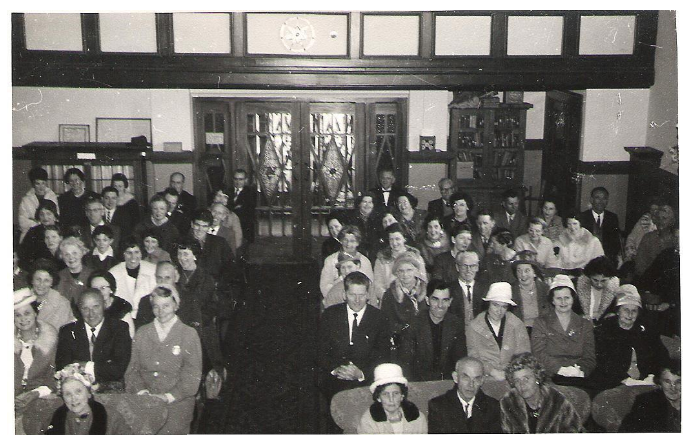
Above: Congregation in Higher Thought Temple, 1960's.

Note: It was unlike any ordinary stone. It was an instantaneous creation and resembled a large drop of fluid).