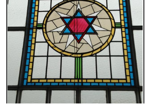
One of the leadlight and stained glass windows